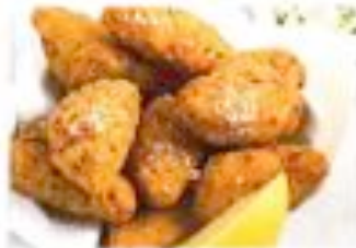
Crispy Fried Artichokes