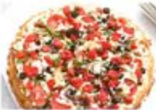
BJ's Favorite Deep Dish Pizza

Valid for dine in or take out. Not valid towards alcoholic beverages or Happy Hour specials. Please do not distribute flyers on-site during the event. Flyers must be printed and presented to the server.