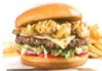
Crispy Jalapeño Burger